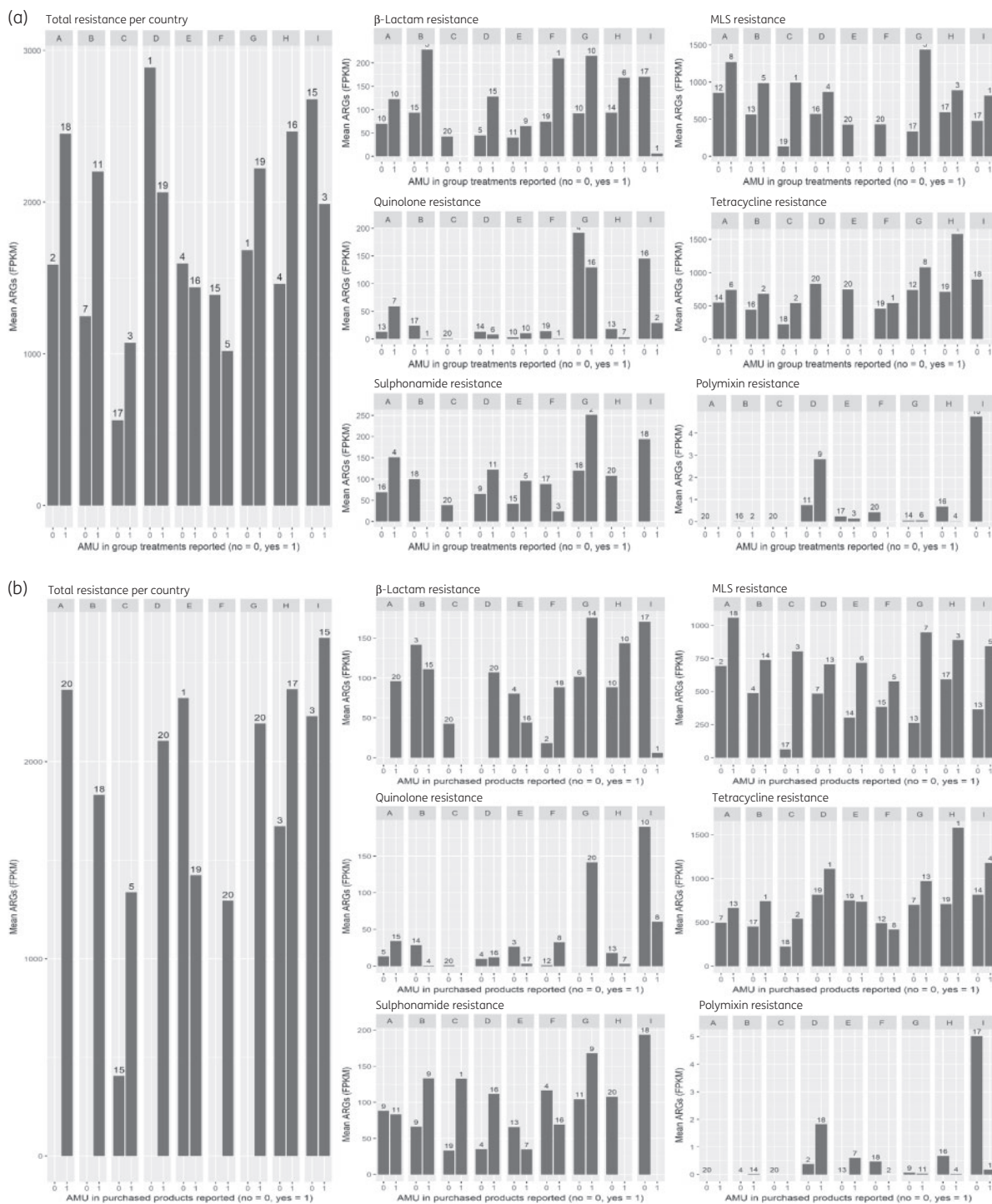
Figure 1. (a) Mean sum of ARGs in FPKM of farms that did or did not report AMU in group treatments for the sampled flock, grouped by country. Left: total ARGs versus total AMU per flock with number of farms shown above the bars. Right: ARGs of several (handpicked) antimicrobial classes/groups versus corresponding AMU per flock with number of farms shown above the bars. (b) Mean sum of ARGs in FPKM of farms that did or did not report AMU in purchased products by the whole farm in the year before sampling, grouped by country. Left: total ARGs versus total AMU per farm with number of farms shown above the bars. Right: ARGs of several (handpicked) antimicrobial classes/groups versus corresponding AMU per farm with number of farms shown above the bars.