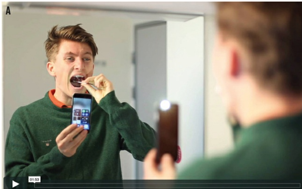
FIGURE 2 / The video instruction of (A) swab and (B) anti-body testing developed specifically for this trial and distributed to the participants via e-mail and QR code on delivered material.