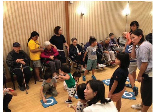
Figure 3 | Social intergenerational play on Moto Tiles by Culture Homes in Hong Kong.

designed to be a single player game. Similarly, with the Piano Game the C of the Playware ABC facilitated that the therapist could easily construct their own new version of the game as a social play for more users. In this way, seniors now group around the Moto Tiles (Figure 2) and together they perform piano melodies such as Twinkle Twinkle Little Star and When the Saints Go Marching In.