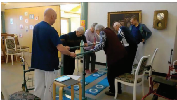
Figure 2 | The Piano Game amongst seniors and therapist in Finland.