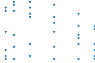
Figure 2: A semi-grid.

quasi-linear in the original input size: in the worst case |\hat{\mathcal{P}}| \approx n^2 so the complexity becomes \tilde{\mathcal{O}}(d_X d_Y + n^2) , which is quadratic in the input size when d_X d_Y < n . For Hermitian codes, then \hat{\mathcal{P}} = \mathbb{F}_{q^2}^2 , hence Pan’s algorithm would give complexity \tilde{\mathcal{O}}(n^{4/3}) . Our MPE algorithm presented in Section III-A essentially generalizes Pan’s algorithm to achieve quasi-linear cost on point sets with only semi-grid structure, see Figure 2; therefore the performance of our algorithm is never worse than Pan’s. Moreover, though few C_{ab} curves form a grid, we observe in Section V-A that certain nice families, including the Hermitian curve, form semi-grids, implying that our evaluation algorithm has quasi-linear complexity for codes over these curves.