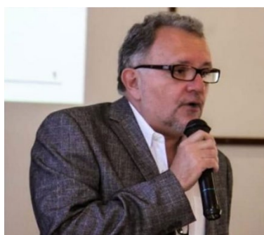
Prof. Fernando Pellegrini Pessoa

This work evaluates the economics, environmental impact, risk assessment, and optimal processing route of bio-SA production from multiple feedstocks (first, second, and third-generation), including (1) glucose, (2) corn stover, (3) glycerol, and (4) seaweed. A superstructure-based optimization model consisting of 39 processing alternatives with a technology readiness level of 7–9 is developed, and the optimal topology for bio-SA production by maximization of the net present value under deterministic and stochastic conditions is identified. Once optimization is completed, the framework provides clear guidance for multi-criteria analysis, including the technical, economical, and environmental aspects of the biorefinery.