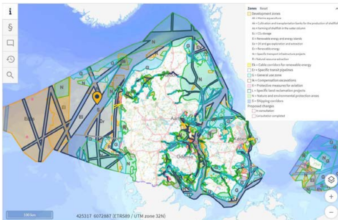
Figure 2. Screen shot of the Global Wind Atlas web page, showing the user interface, approximately 2 TB of data available for display in the atlas.

2 Bundesamt für Seeschifffahrt und Hydrographie (German regulatory Federal Maritime and Hydrographic Agency of Germany)