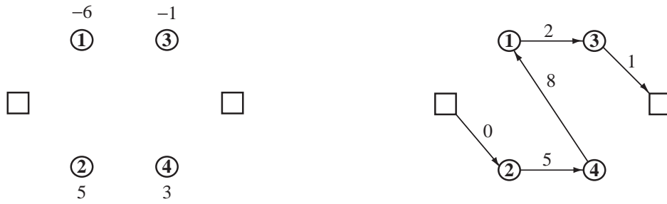
Figure 2: Many-to-many problem. A positive vertex label x means that the vertex supplies x units; a negative vertex label -y means that the vertex demands y units. Arc labels indicate vehicle load.