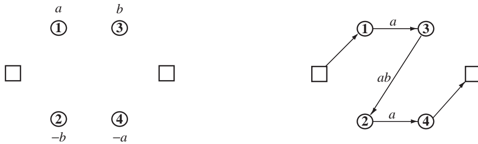
Figure 3: One-to-one problem. Vertex label z means that the vertex supplies commodity z ; vertex label -z means that the vertex demands commodity z . Arc labels show the commodities carried by the vehicle.