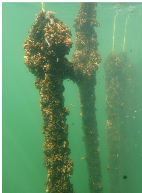
Figure 1. Mussel farming with the Smartfarm system.

Nitrogen/phosphorus measures primarily aim to reduce the effects of eutrophication through immobilisation and subsequent removal or storage of nutrients in the sea floor. The individual measures may provide other ecosystem services related to the environmental indicators in the Water Framework Directive, but their effectiveness for immobilising/removing nutrients is the main parameter assessed. In the latest catalogue of marine measures (8), these include i) extraction cultures such as the cultivation of seaweed and mussels and ii) initiatives that bind nutrients in the sea sediment and in standing biomass or promote degassing of nitrogen such as the establishment of eelgrass beds.