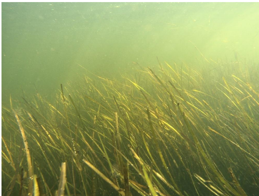
Figure 3. Eelgrass bed in Roskilde Fjord.

In the Danish Environmental Protection Agency's monitoring of eelgrass, coverage levels of eelgrass <10% are no longer categorised as eelgrass beds. At the beginning of the 20th century, eelgrass dominated the sea floor along sandy coastal areas and most Danish fjords and grew considerably deeper than today. However, the eelgrass disease together with 50 years of human impact on the sea have pushed the populations into shallow water, where the eelgrass has difficulty re-establishing itself naturally. Where there is no eelgrass habitat in the designation basis for the EU Habitats Directive, three different types of seagrass appear for the Atlantic area and eight for the Baltic Sea area on the EUNIS list of "Seagrass meadows".