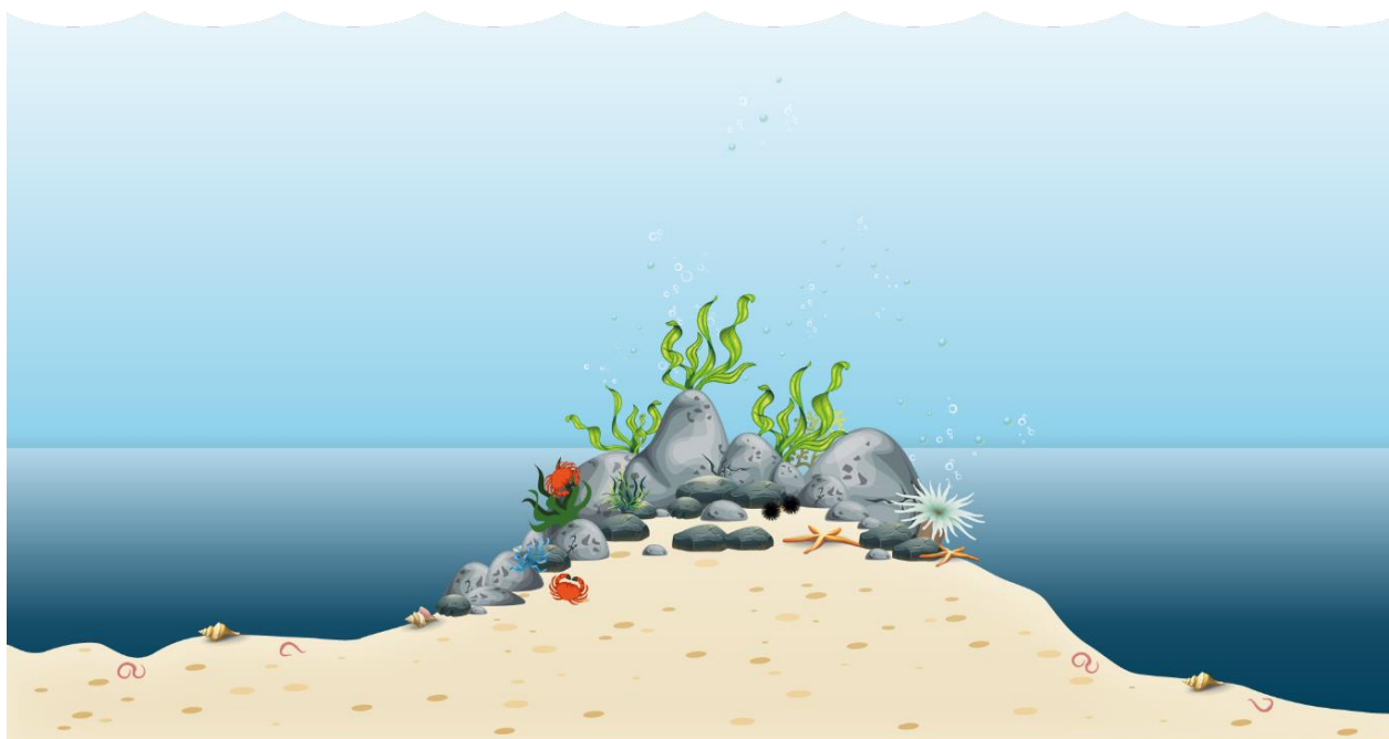
Figure 2. Sketch of a stone reef with associated vegetation and wildlife. Drawn by Tinna Christensen.

A stone reef is, biologically speaking, an area that rises from the surrounding sea floor and consists of a hard substrate such as stone or rock, covering minimum 5% of the sea floor surface, and the area must have a size of minimum 10 m 2 .