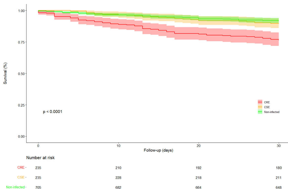
Fig. 1. Survival up to day 30 of patients with CRE infections, CSE infections, and non-infected patients.

The incidence rate ratio for CRE infections compared with CSE infections and to non-infected patients were 2.25 and 2.83, respectively. The estimated PAF of mortality was 66.72% and 19.28% when compared with CSE in high and low exposure prevalence scenarios, respectively, and 47.36% and 9.61% when compared with non-infected patients in the same scenarios (Table S5).