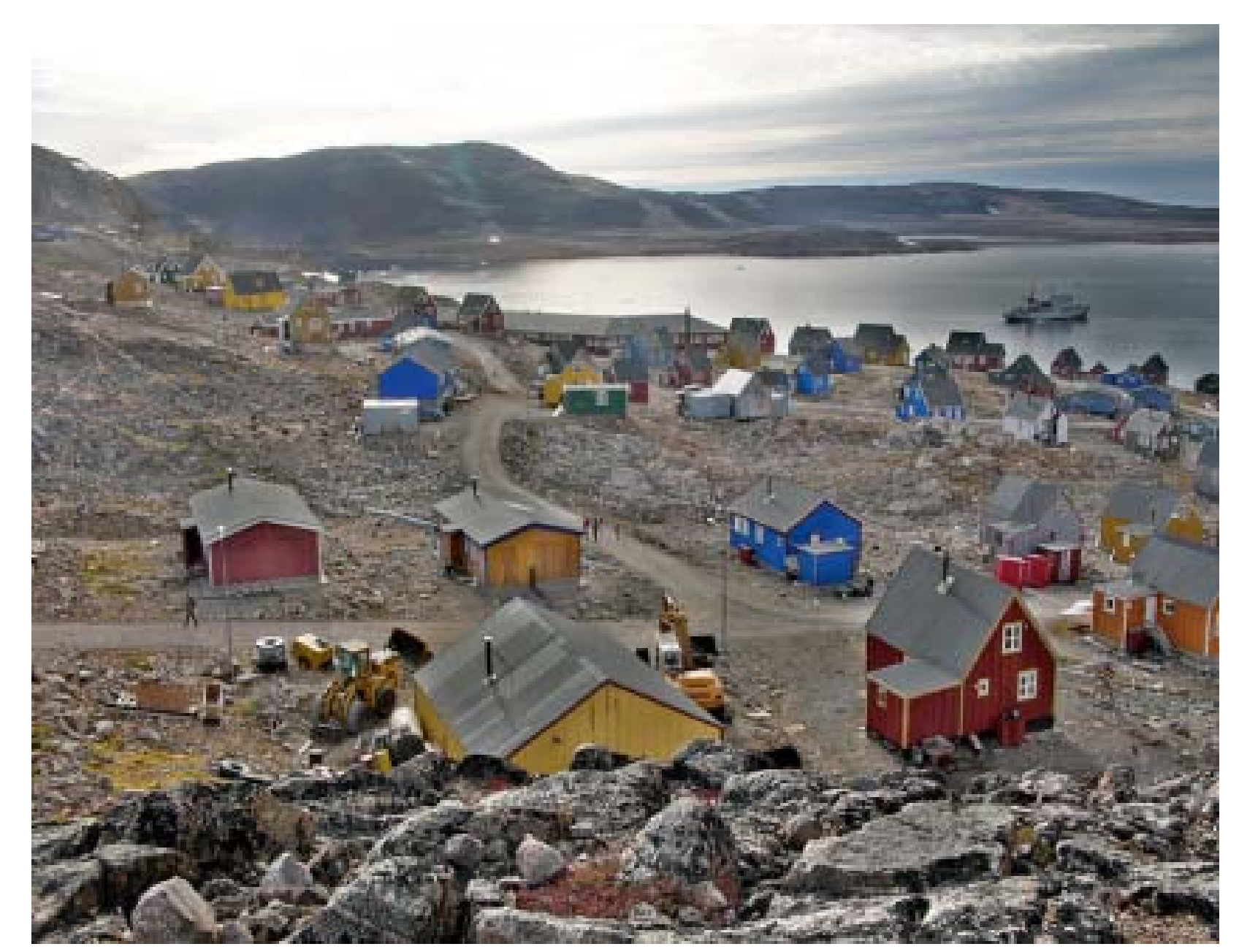
Fig: Arctic definition and Ittoqqortoormiit, settlement in Greenland