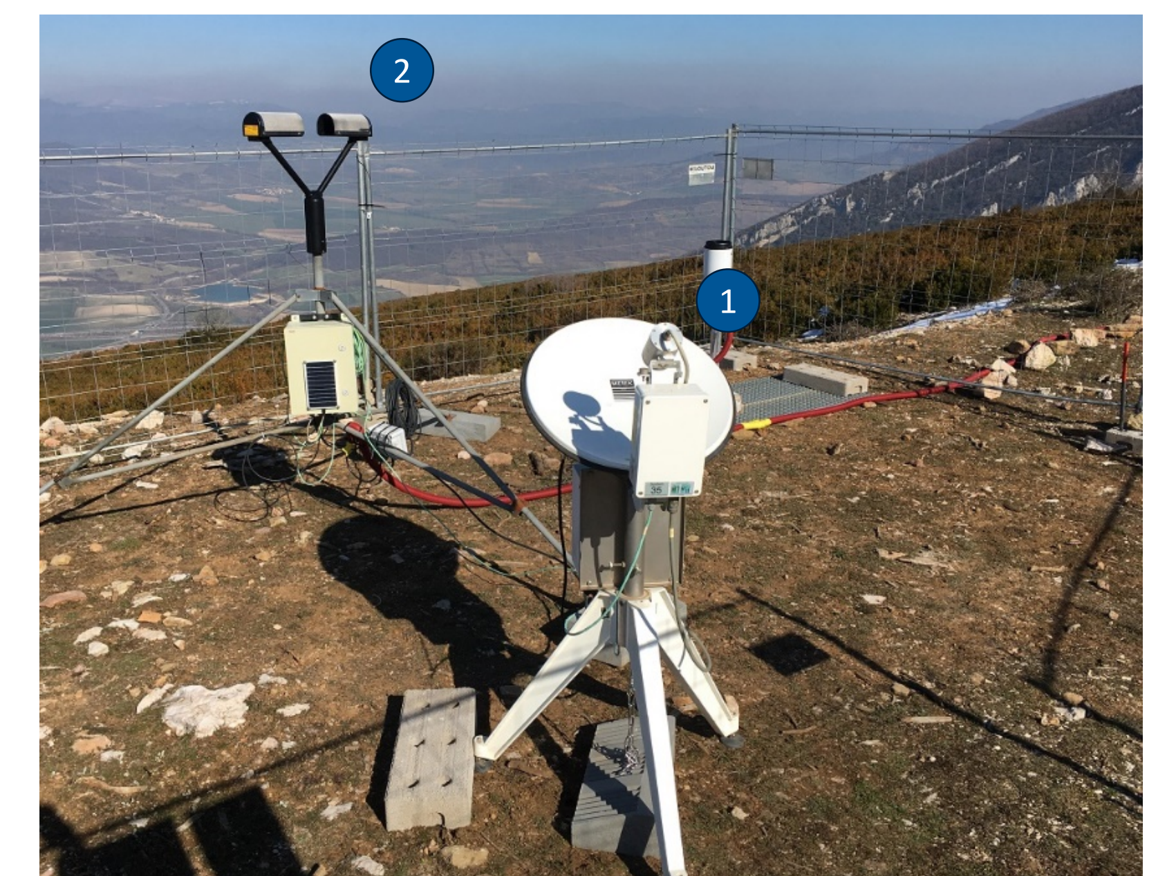
Figure 3. ALAIZ site with micro rain radar (1) and disdrometer (2).

The database is being established. Collaboration with Horizon Europe funded projects FLOW and MERIDIONAL is on-going to enable wider benefit of the data.