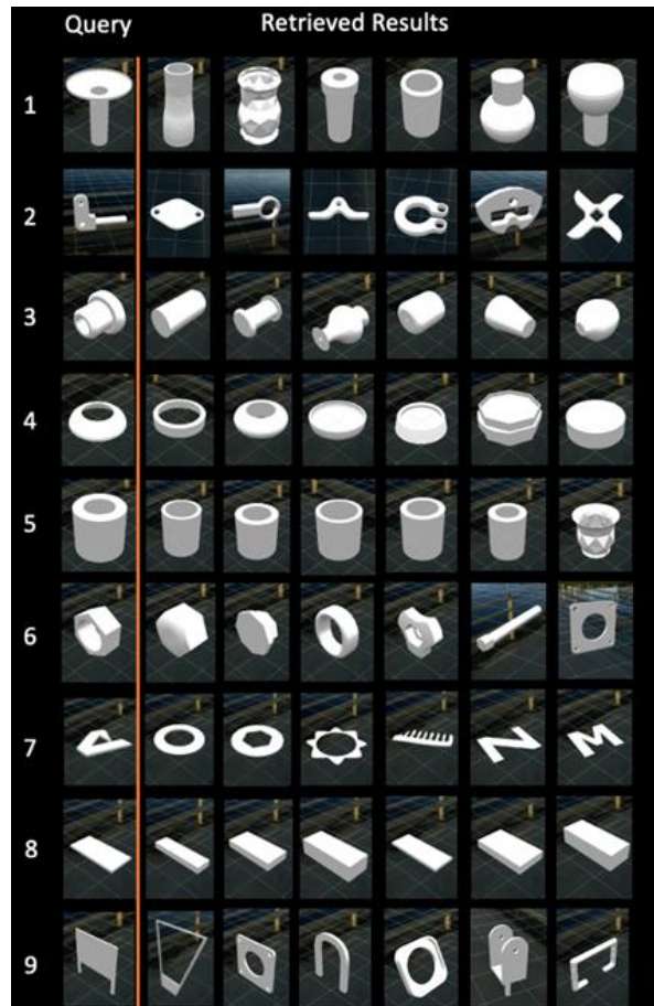
Figure 2: Retrieval results are obtained from the Fusion 360 Segmentation dataset, where six nearest neighbors are retrieved for each query sample.