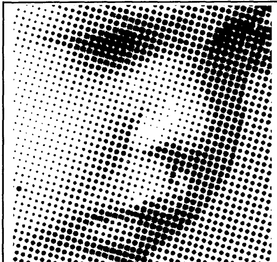
Figure 6. Reconstruction in four blocks using polynomial grid. The original was descreened following the grid.

The compression rate may be increased by employing conventional image coding, as predictive or transform coding, to the grey values of the image.