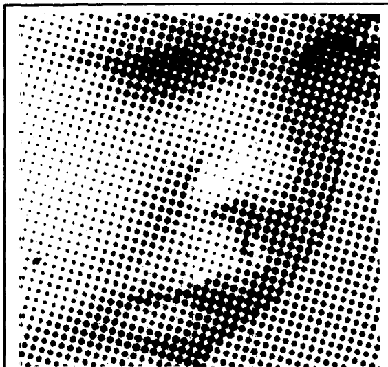
Figure 5 Binary image of the original 512 by 512 scanned halftone picture.

The halftone in Figure 5 is scanned at approximately 800 lines/cm (2000 l/inch) and the screen ruling is approximately 60 lines/cm (150 l/inch). Descreening the halftone and coding the grey values would give a data compression of 22.2. Compared with this simple grey value coding, coding the change and the triangles when changing requires more bits, coding the cells, here as in most cases, requires one less bit. All in all for the test picture, coding changing between black and white cells gives a little higher data compression rate, when storing border values.