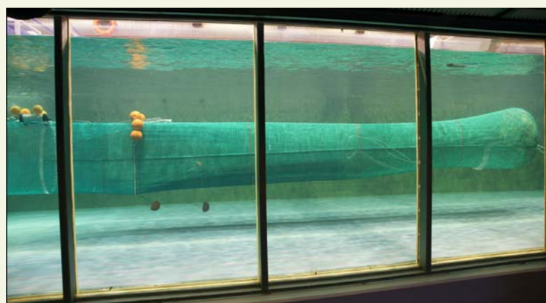
Figure 3. The triple-sampler in the Hirtshals (Denmark) flume tank.

The Minisamplers have been tested Hirtshals flume tank (Denmark) (Fig 3.). We have also used the system during demersal trawl selectivity experiments using a relatively small (20 m) commercial fishing vessel which had no ramp. Two dual-samplers were placed on codend covers (Fig. 2), made to collect escaping fish from the trawl codends (Madsen et al., 2001) that were fished simultaneously in a twin-trawl system.