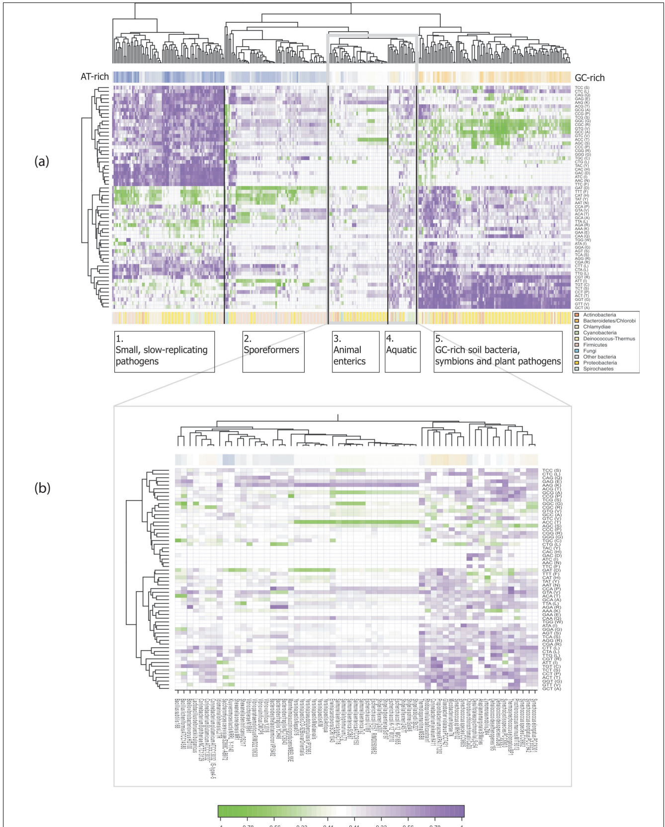
Figure 2 (see legend on next page)