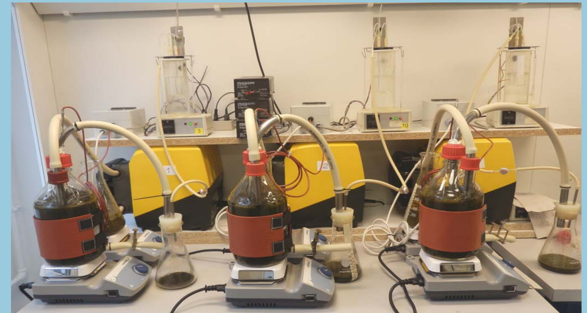
Figure 1. The CSTR apparatus

In this study, three continuous stirred tank reactors (CSTR, Fig. 1) treating cow manure at 37°C were evaluated at high ammonia concentrations. Inoculum was obtained from Hashøj biogas plant.