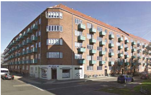
Fig. 3 Kretahus, the private owned case-study buildings

The preliminary results are described in the following ending up in the focus points that can be drawn by use of the assessment method.