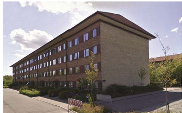
Fig. 4 Korngården, the council housing used in case-study