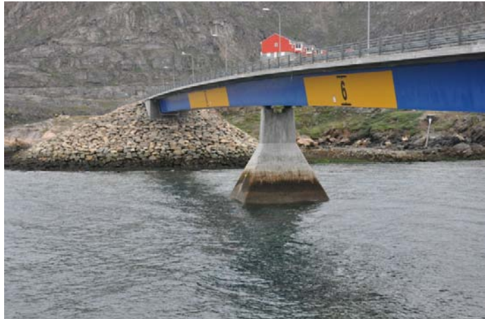
Figure 1 - The pillar on the Ulkebugt Bridge.

The concrete pillar is exposed directly to seawater, as it is shown in Figure 1. The pillar is founded on the seabed, so a major part of the concrete surface is constantly under water and thereby exposed to chloride ingress by capillary suction and diffusion. The ingress is relatively slow under water in this dense concrete and due to lack of oxygen there is no real concern for chloride driven corrosion. The most critical part on the surface is in the splash-zone with tide and wave action. In the Ulkebugt the tide has a variation of around 4 meters. The chloride ingress in the splash-zone gives the best opportunity to estimate the lifetime on the concrete pillar.