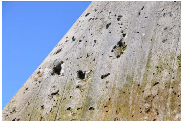
Figure 3 – Deep holes into the concrete surface.

However the concrete surface of the pillar shows in some areas signs (smaller and larger holes in the surface) which could indicate freeze-thaw damages. These holes are probably smaller and larger agglomerates of air voids, probably caused by an improper compaction of the fresh concrete in relation with a "closed" design of the formwork, which leads to a high amount of entrapped air voids (equal to agglomerates of air voids) along the form side. In places with larger holes, the seawater is allowed to enter far into the holes from start, making the concrete and reinforcement more vulnerable to chloride initiated corrosion. The result of insufficient compaction of the concrete is many deep holes in the concrete, which is contributing to the overall state of the concrete pillar.