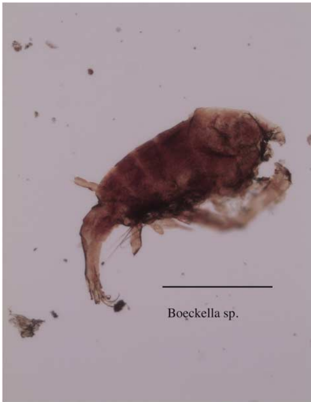
Fig. 3. A juvenile specimen of the calanoid copepod Boeckella sp. from Lake Hoare, McMurdo Dry Valleys, Antarctica. Scale bar represents 500 µm.

In addition to the above listed rotifers we recorded one complete specimen of the calanoid copepod (Fig. 3) plus the remains, assorted indistinguishable body parts, of a few others, presumably the same species. The complete specimen, a Boeckella (length 1.1 mm), was a juvenile thereby excluding the possibility for further taxonomic analysis beyond the genus level (Prof G. Boxshall, personal communication 2010). Several species of copepods are common on the sub-Antarctic islands, and the hitherto most southern recording of an adult copepod is at Prince Charles Mountains (71°S, Table II). Our recording of a Boeckella in Lake Hoare is the first time a sub-adult copepod has been recorded in freshwaters as far south as 77°S.