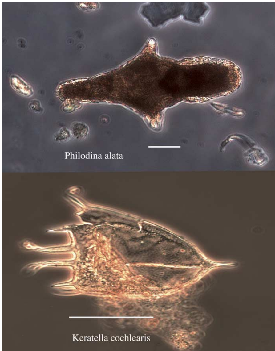
Fig. 2. Rotifer species previously recorded on the Antarctic continent, including Philodina alata Murray, 1910 (length 225 \mu\text{m} ) and Keratella cochlearis Gosse (length without spines: 75 \mu\text{m} ). Scale bar in each part represents 50 \mu\text{m} .

whereas others were asymmetrical with one long and one short posterior spine. It should be noted that this was a true observation, i.e. the shorter spine had not broken off in the sampling process. Finally some specimens had a pair of very short posterior spines reminiscent of K. testudo (Ehrenberg, 1831) and one individual was seen that did not have posterior spines at all. Kellicottia longispina (Kellicott) (Fig. 1) is also a new record for the Antarctic and was very common in Lake Hoare with more than 50 individuals per litre in the surface waters. Notholca foliacea (Ehrenberg) (Fig. 1) is a common species in many parts of the world, but another new record for the Antarctic.