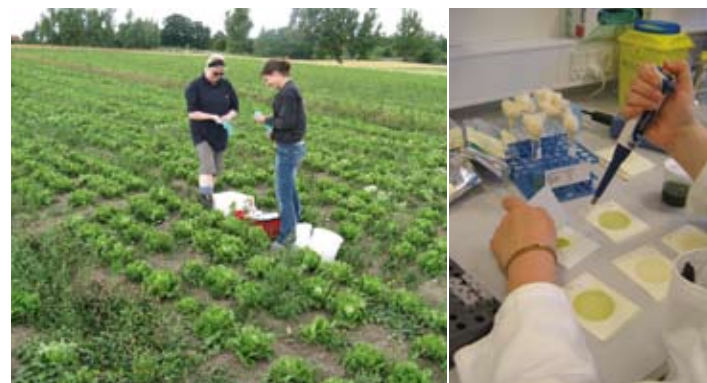
Figure 2. Sampling of lettuce plants for subsequent screening for the prevalence of human pathogens.

Part 1b shows the percentage of samples from the individual countries that proved positive for the respective pathogens.