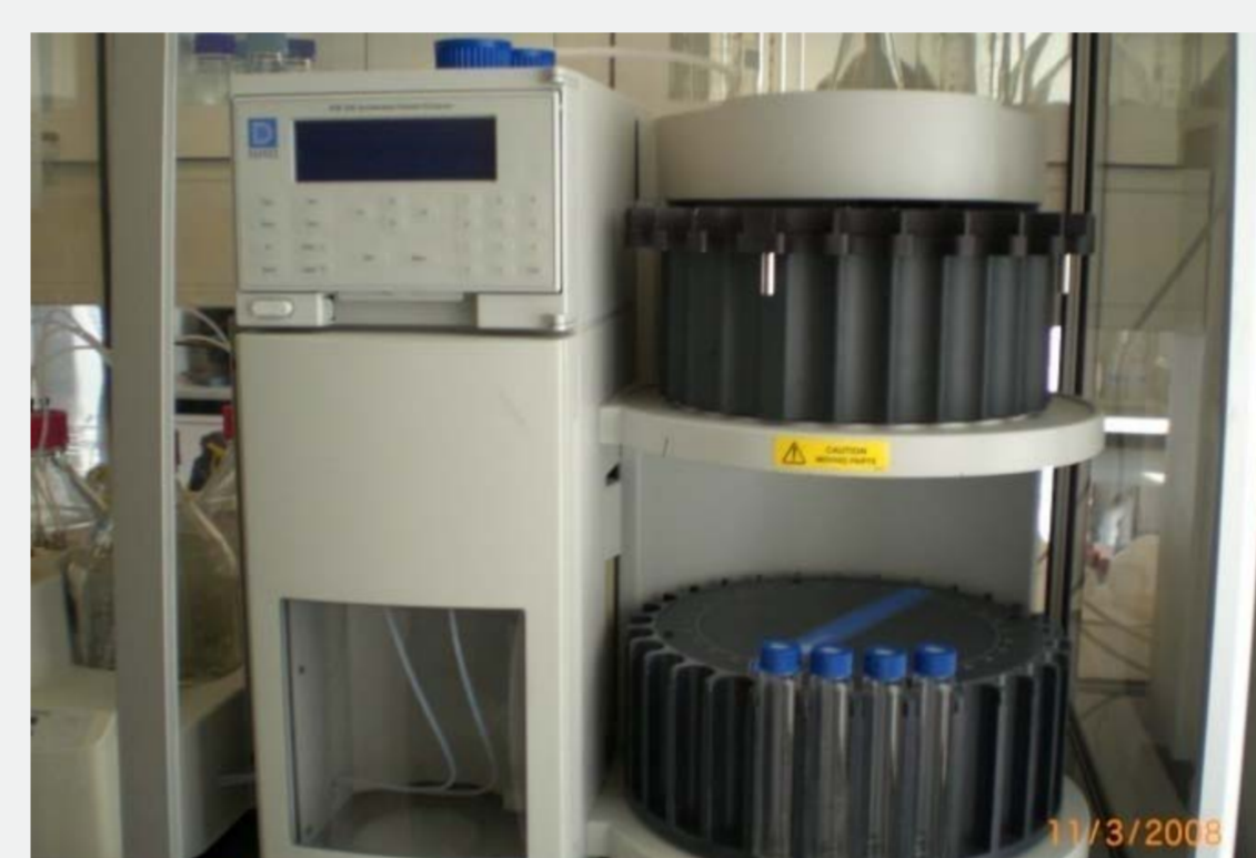
PLE (Pressurized Liquid Extraction) - for extraction of flavonoids and phenolic acids before analysis.