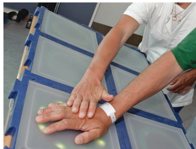
FIG. 1. The modular interactive tiles can be assembled in different configurations ( top left, top right, and bottom right ) for different playful exercises and levels.

modular interactive tiles once a week for 12 weeks. The senior community activity centers are organized so that most elderly individuals are transported to the centers from their private homes once or twice a week to engage in center activities for social interaction, and the elderly participants