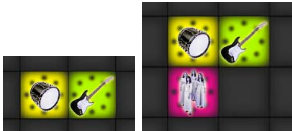
Fig. 4. Left: Connecting two tiles. Right: 2-sides connection example.

To actually start the music, the user has to press the play/stop icon, positioned at the bottom-right side of the screen (see Fig. 3). At this point, the music will keep playing and the remaining music tiles can be connected to the former two enriching the music scenario of the song running. In the same way, by dragging the tiles around and rearranging their geometry, the user changes the music sequence and flow.