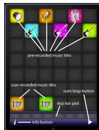
Fig. 3. MagicTiles for iPad.

The MusicTiles app that runs on iPads and iPhones, is made of a small number (i.e. more than 3 less than 10) of virtual music tiles. Each single tile embodies a single instrument and each instrument-tile is capable of expressing seven different musical solution (i.e. loops) or variation of the same one. Every instrument of a MusicTiles song is wrapped inside a single tile and, therefore, we can have a tile for vocals, one for the rhythm guitar, one for the bass, one for the piano, etc. At the start, the user is presented with all the tile-instruments of a given song inside the tiles board with the tile-instruments being disconnected from each other (see Fig. 3).