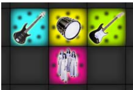
Fig. 5. A 3 Sides connection example.

Likewise, as in Fig. 5 the Drum tile will play 3 Sides loop, the Choir tile the North Side loop, the Guitar tile will play the West Side loop, and the Bass tile the East one.